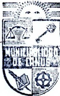
MANUEL QUINDIMIL INTENDENTE MUNICIPAL